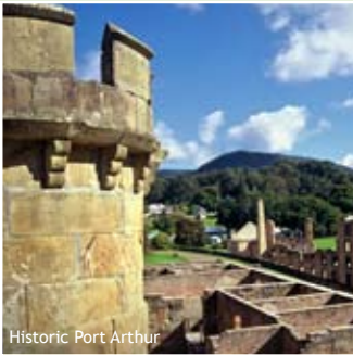
Historic Port Arthur