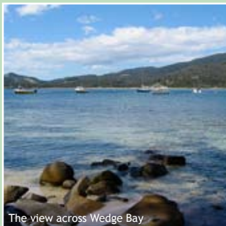
The view across Wedge Bay