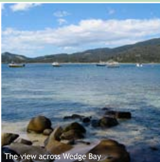
The view across Wedge Bay