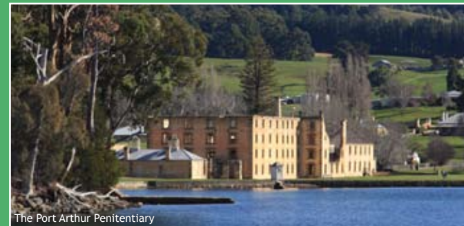
The Port Arthur Penitentiary

For more details please call Customer Service on 1300 653 322 .