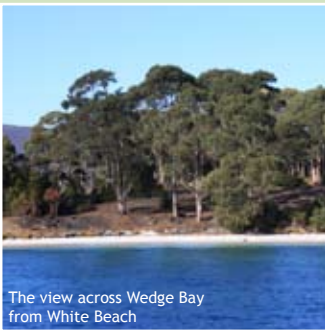
The view across Wedge Bay from White Beach