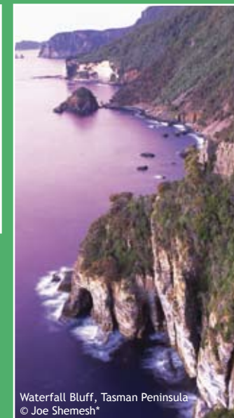
Waterfall Bluff, Tasman Peninsula

For the adrenaline junkie, the Tasman Peninsula has some of Tasmania's best diving with giant kelp forests, shipwrecks or sea caves to explore; activities that cater to all levels of experience. If extreme surfing is more your style, Shipstern's Bluff may tempt you or the surf off Eaglehawk Neck, which is less extreme but a lot of fun.