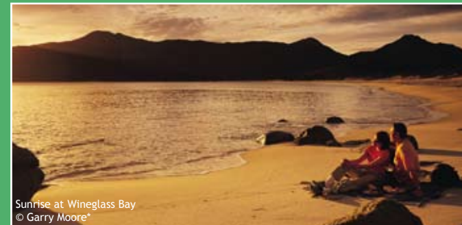
Sunrise at Wineglass Bay

For more details please call Customer Service on 1300 653 322 .