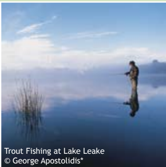
Trout Fishing at Lake Leake