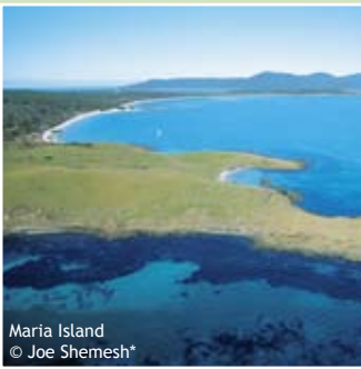
Maria Island