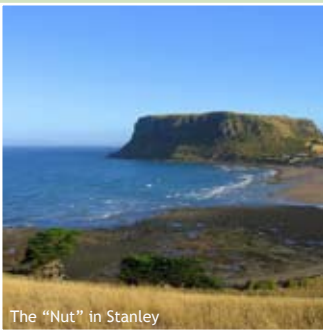
The "Nut" in Stanley