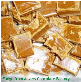
Fudge from Anvers Chocolate Factory