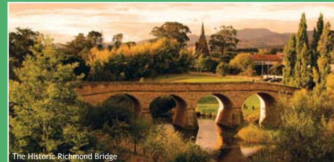
The Historic Richmond Bridge

For more details please call Customer Service on 1300 653 322 .