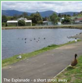
The Esplanade - a short stroll away

The home in Milford Street, Lindisfarne is located just two minutes from the Derwent River - a lovely place for a stroll or to feed the ducks. It is an ideal base from which to explore Hobart. Providing three bedrooms, it comfortably accommodates five people, and is ideal for couples or families.