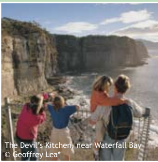
The Devil's Kitchen, near Waterfall Bay