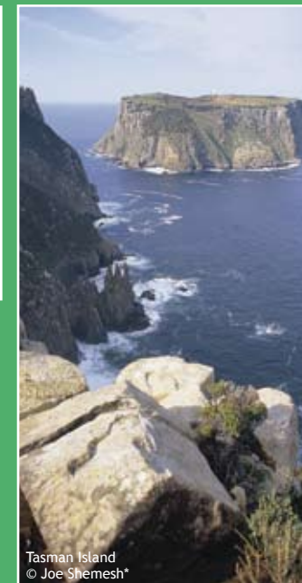
Tasman Island

For something more adventurous, try kayaking at Kettering, half-an-hour south of Hobart, or continue on south to the Tahune AirWalk and walk among the treetops. A further 90 minutes' drive will take you to Hastings Caves and the thermal pool. If you enjoy bushwalking, there is a wide variety of walks; in fact there are too