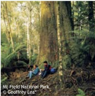
Mt Field National Park