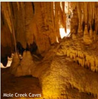
Mole Creek Caves