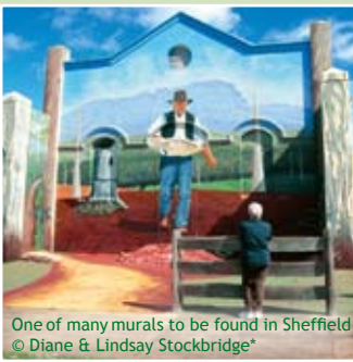
One of many murals to be found in Sheffield