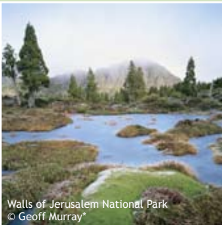
Walls of Jerusalem National Park