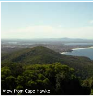
View from Cape Hawke