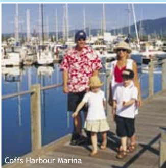
Coffs Harbour Marina