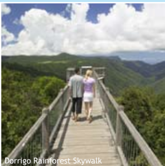
Dorrigo Rainforest Skywalk