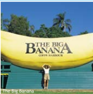
The Big Banana