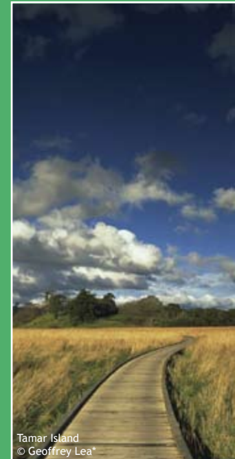
Tamar Island

There are a number of quaint towns within a short drive of Launceston; Campbell Town, Ross and Evandale to name but a few. Each town is rich with history and well worth exploring. Launceston itself, has perhaps the greatest proportion of beautiful, historic buildings of any city in Australia. George Town, on the banks of the Tamar River and just north of Launceston is the third oldest settlement in Australia and has a rich maritime history.