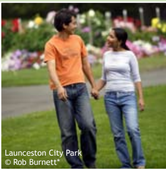
Launceston City Park