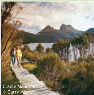
Cradle Mountain