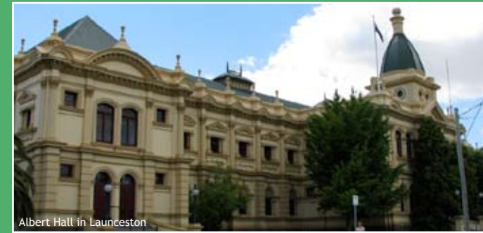
Albert Hall in Launceston

For more details please call Customer Service on 1300 653 322.