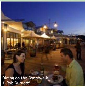
Dining on the Boardwalk