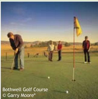
Bothwell Golf Course