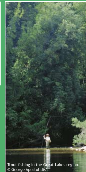
Trout fishing in the Great Lakes region

Less than an hour away is Lake St Clair; an area that provides a variety of bushwalks suitable for all, from the gentle Lake Walk at Cynthia Bay, to the world famous Overland Track, a six-day, 65km trek from Cradle Mountain to Lake St Clair. The shores of the Great Lake are also a great place to walk.