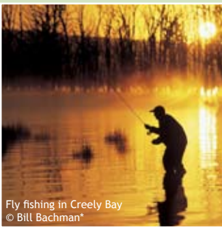
Fly fishing in Creely Bay