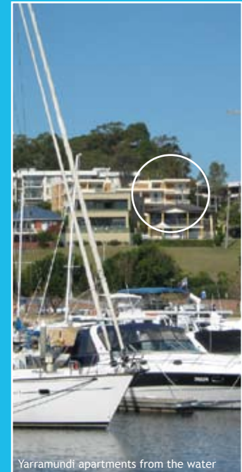
Yarramundi apartments from the water

There's great snorkelling off Little Beach and, for a truly amazing view, nothing beats paragliding behind a speed boat. Four-wheel-drive enthusiasts are catered for and will love the famous sand dunes of Stockton Beach.