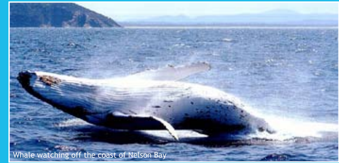
Whale watching off the coast of Nelson Bay

For more details please visit the website, www.waterviewapartments.com.au or call Customer Service on 1300 653 322 .