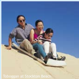
Toboggan at Stockton Beach