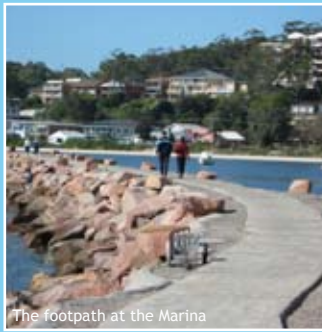
The footpath at the Marina

Yarramundi is situated in a prime position in Nelson Bay with stunning panoramic views of the marina from your very own balcony while being a short stroll away from local dining and attractions. With two bedrooms and the ability to comfortably sleep six people, these fully self-contained apartments are great for families, groups or a couple wanting to get away for a break.