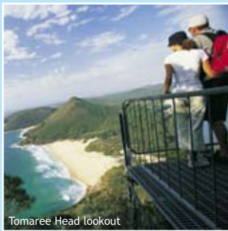
Tomaree Head lookout