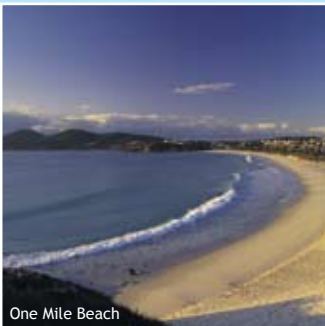
One Mile Beach