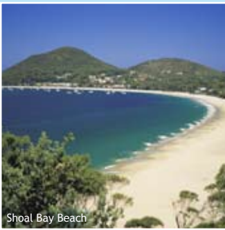
Shoal Bay Beach